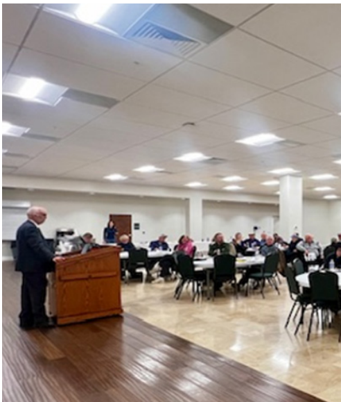
Photo: Workshop attendees and speaker